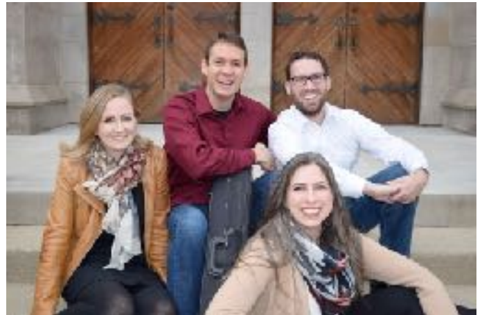
The Kontras Quartet string ensemble is in residence at Grace and often plays in Sunday morning worship services.

The concert will also be available via livestream on the Kontras Quartet YouTube channel.