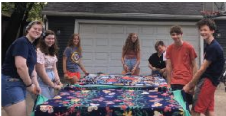
The Welcome Back Picnic for Grace youth included spending time tying blankets to cozy up the Youth Room.

Schedules for Youth Ministry, Sunday School, and Confirmation can be downloaded from the Grace website.