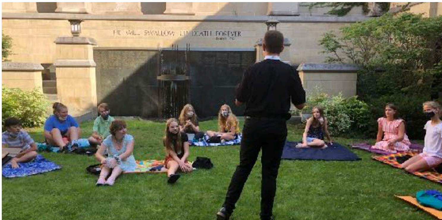
Seventh and eighth grade confirmation class is meeting in the Memorial Garden this fall.

GRACE LUTHERAN CHURCH • 7300 W DIVISION • RIVER FOREST IL 60305 • 708-366-6900 • WWW.GRACERIVERFOREST.ORG