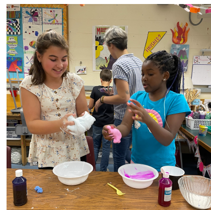
Photos of the many clubs and activities available at Grace School. November, 2022.