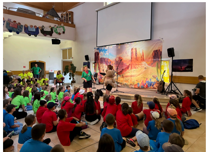
Photos of the Slovak Mission Trip 2022