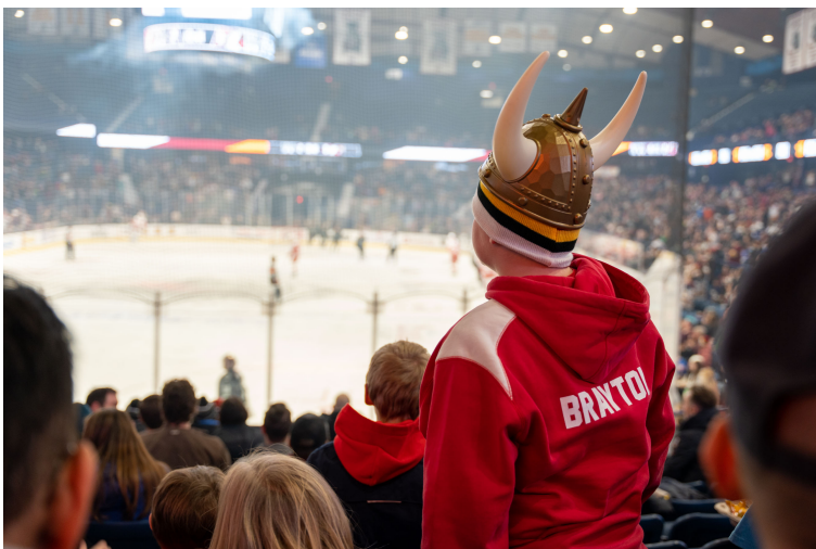
Group of Grace students rehearsing at the stadium and watching Wolves game. February 2023.