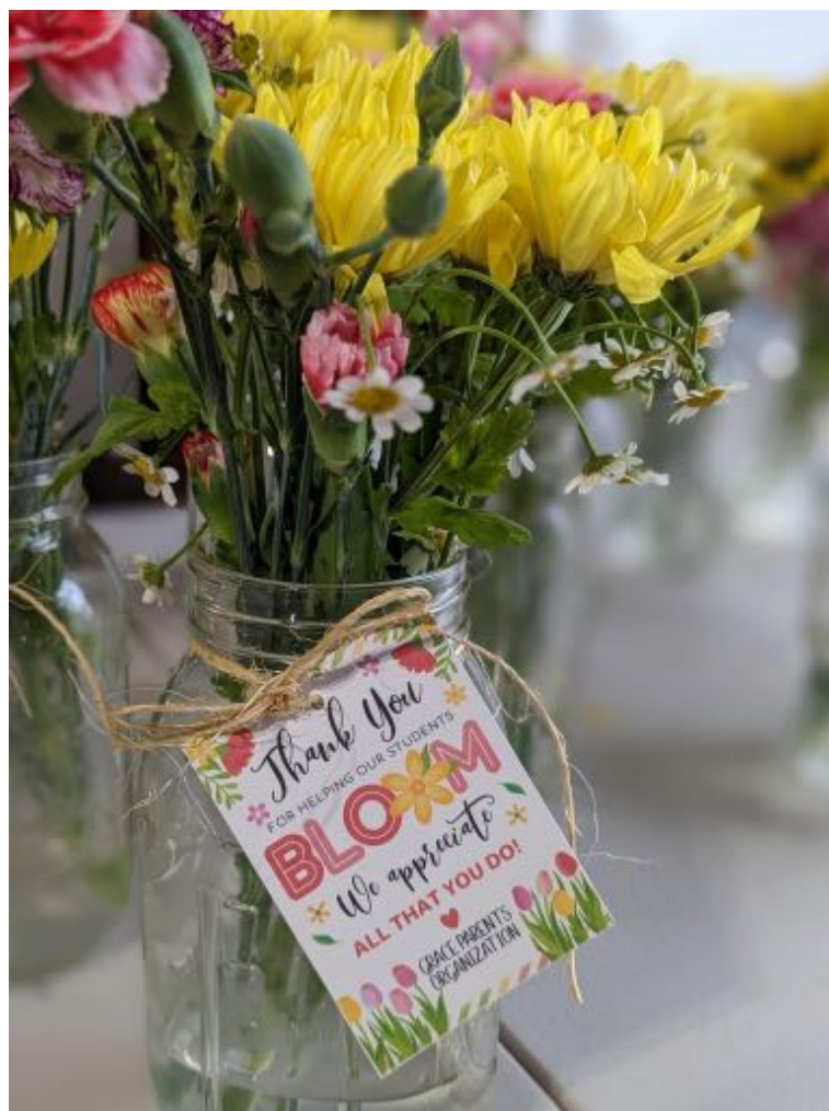
Teacher Appreciation Week flowers.

Teacher Appreciation Week at Grace Lutheran School was May 8 to 12. Each day, our wonderful Grace Parent Organization planned something special to remind our teachers how much we need and love them. Starting on Monday, we proudly displayed our "We love our teachers" sign on the front lawn. Tuesday, each teacher received a beautiful bouquet of flowers. Wednesday and Thursday there were treats made by Grace's parents available for teachers to snack on. On Friday it all culminated in a wonderful breakfast and teacher gifts delivered to their classrooms. Thank you to the GPO for all your loving work and thank you to all our teachers for all the energy, love, care, and hard work that you put into each Grace student.