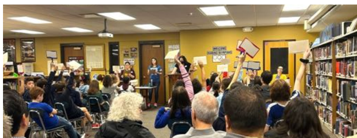
Reading Olympics, May 2023.