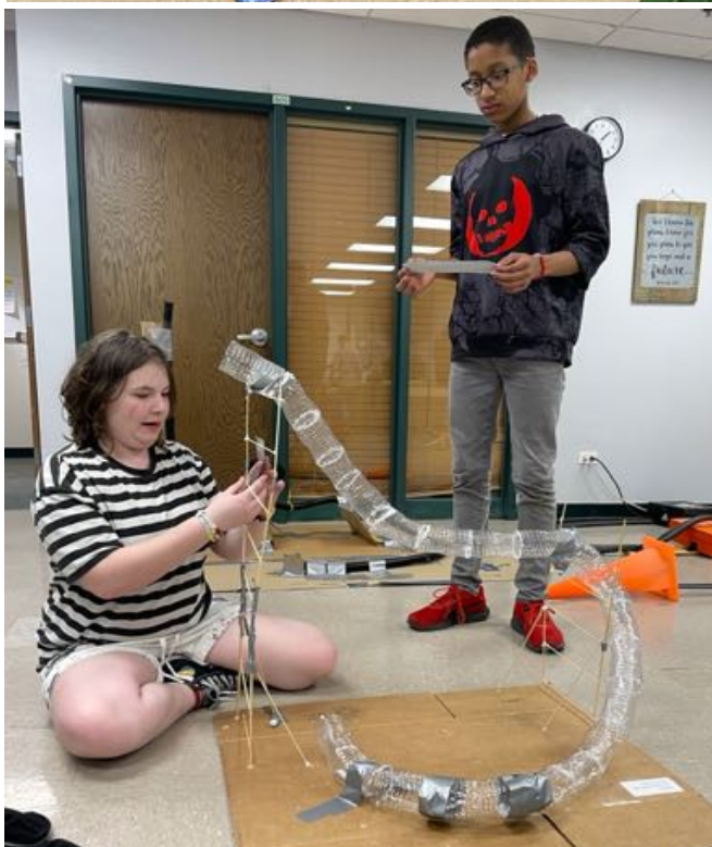
Students displaying their rollercoaster creations. May, 2023.