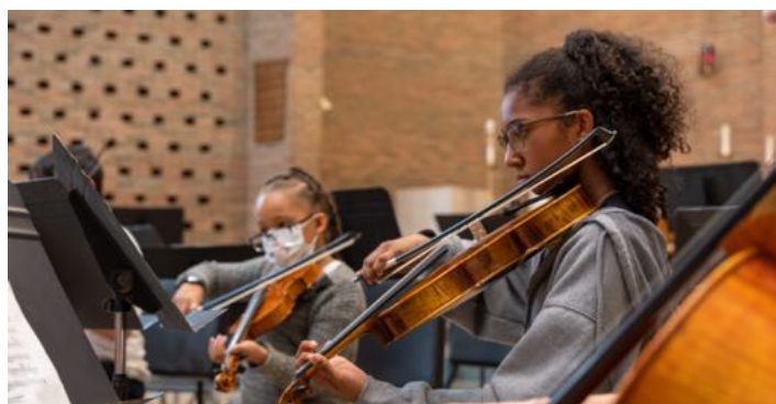
Respectively, Grace's Handbell choir and orchestra performing at the Fine Arts Festival, April 28, 2023.