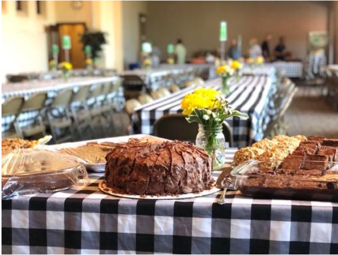
Photos of the Grace Church and School Picnic. September 10, 2023.

First and foremost, a huge thank you to everyone who donated food, spent time helping in some way, or attended the Grace Church and Shool Picnic. What a joy it is to gather as one community! This annual event is something we can do because we have so much help from the community. Thank you for your help, support, and for helping us celebrate this new year of Grace. We look forward to another gathering next year!