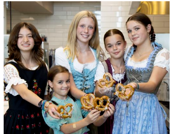
Oktoberfest at Grace 2023.