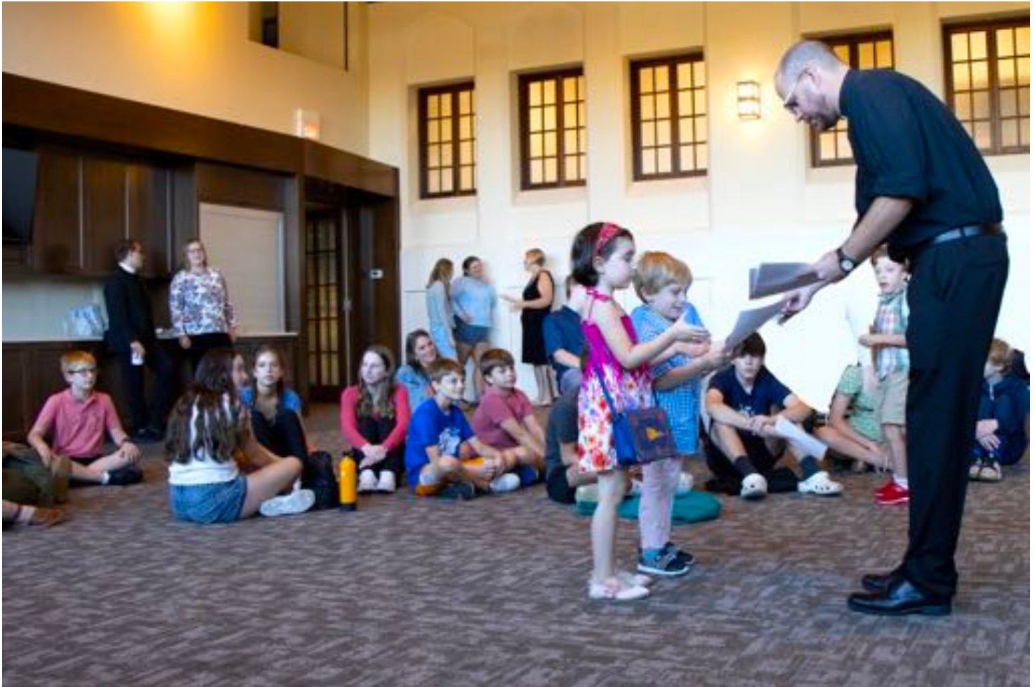
Grace Gathers. September, 2023.

The first few weeks of our new Sunday schedule have found Grace abuzz with activity. Our various faith formation offerings have not only been well attended; they've been wonderful. God's people of all ages and stages are engaging with God and with one another, all leading up to the single worship service at 10:00 a.m. One of my favorite parts of the morning is quickly